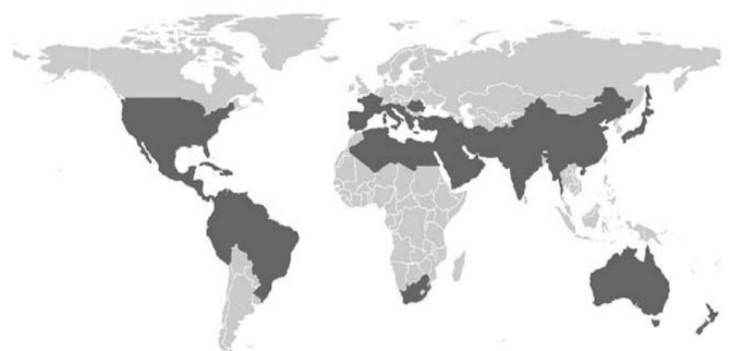
Figure 2. Countries in the World where Arundo Donax is present [5].

It is distributed in the zones with warm or tropical climate.