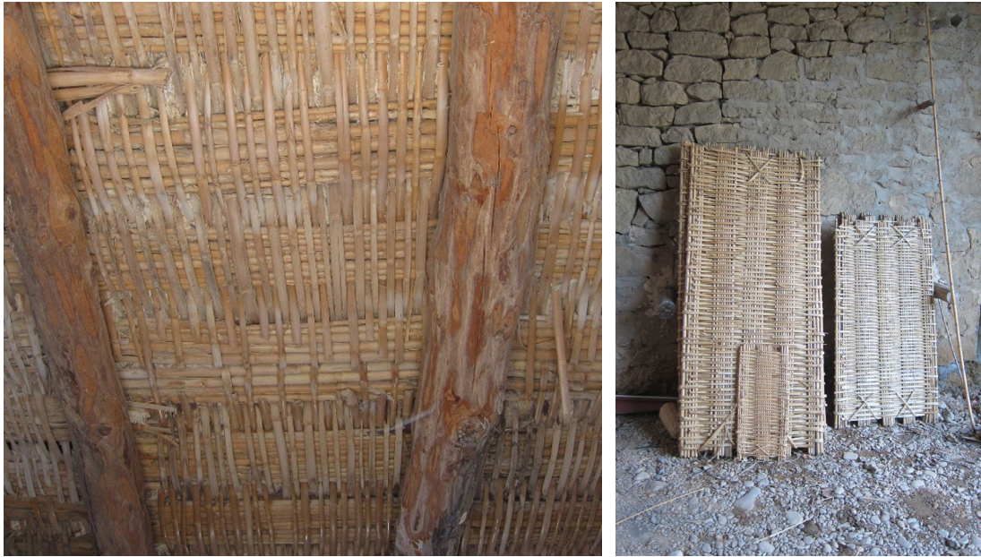
Figure 3. Prefab cañizo to cover the gap between beams (left), and different cañizo formats (right).

In Spain, Arundo Donax has always been a very important building material for many different purposes from walls to ceilings and roofs, even as a protection for workers at the scaffoldings. It was used in situ at the building site where prefab elements called cañizo were placed.