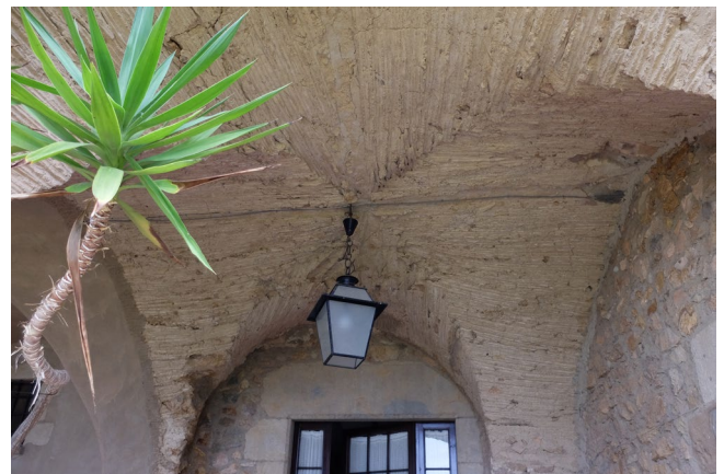
Figure 4. Groined vault, reed texture of the surface generated because of the the fromwork. Palafrugell, Girona, Spain.

It was a much cheaper way to create vaults compared with stone vaults. Wooden guides were connected with Arundo Donax, creating the support surface to be plastered.