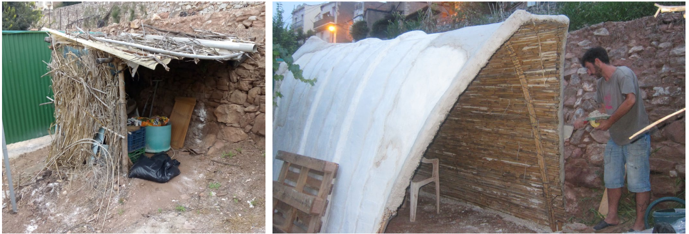
Figure 8. Before (left) and after (right).

Materials used in the construction of the concrete shell.