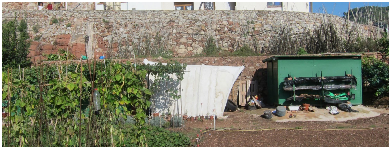
Figure 13. The structure and its surroundings.

The formwork material is natural and abundant; it is distributed in the zones with warm or tropical climate which is also where we can find many of the poorest countries in the world, it does not require special tools and with the range of measures that can be adopted it does not need complex auxiliary elements.