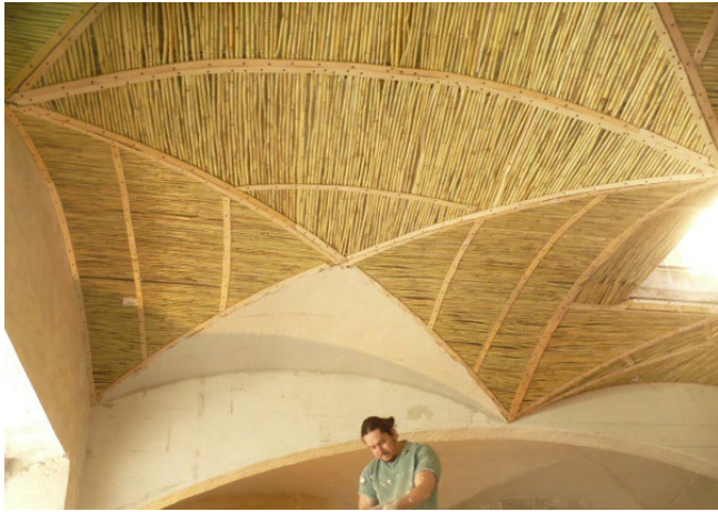
Figure 6. Encamonada vault. Artifex Balear, Mallorca.Spain.