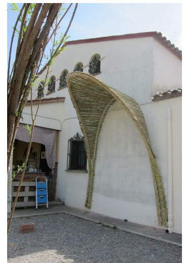
Figure 7. Arundo donax Organic Structures. Author's Projects.