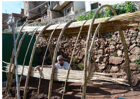
Figure 11. Connecting the archs.