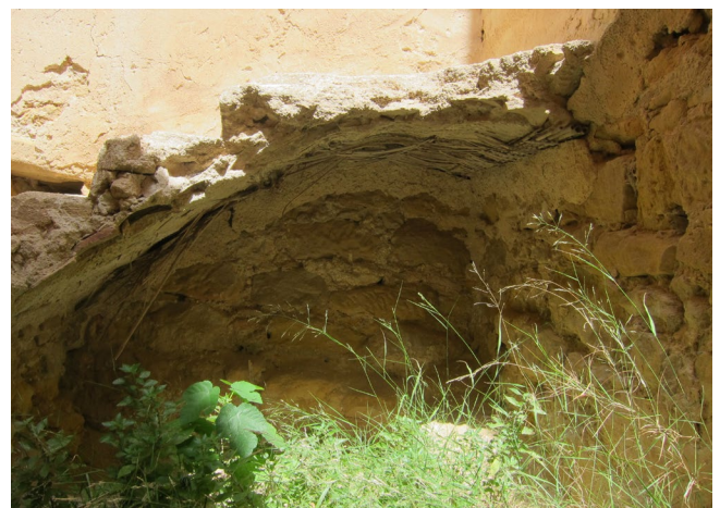
Figure 5. Bended cañizo working as a lost formwork. Fresneda, Teruel. Spain.