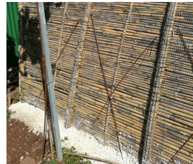
Figure 12. Connection between foundation and shell.