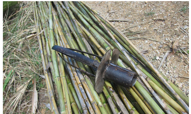
Figure 9. Collected reeds after being cleaned with traditional tool.

This constructive technique is easy to make (suitable for self-construction), affordable and environmentally friendly [8].