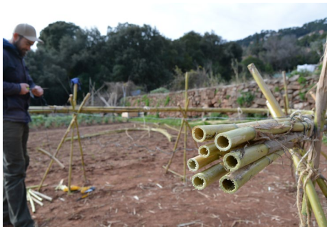
Figure 10. Forming arches with template.